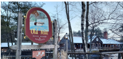
The Old Mill - Westminster

Join your fellow Senior Center friends for lunch! We have two outings scheduled for March to two great local establishments!