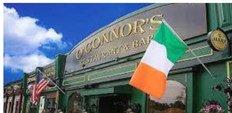
O'Connors - Worcester